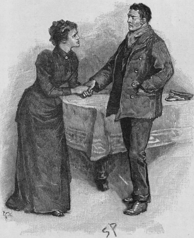
"'THAT'S ALL RIGHT, MY LASS, SAID I."

"It was only a little thing, too. I had come into the parlour unexpected, and as I walked in at the door I saw a light of welcome on my wife's face. But as she saw who it was it faded again, and she