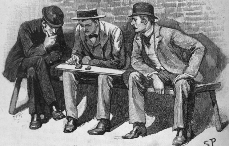
"HE EXAMINED THEM MINUTELY."

He took out the two ears as he spoke, and laying a board across his knees, he examined them minutely, while Lestrade and I, bending forward on each side of him, glanced